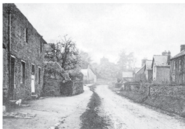
Middle Road, Stanton St John, April 1897, The lady in white is standing in what is now the shop doorway.