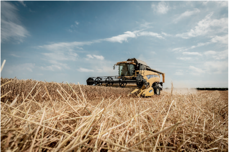
Harvesting at Stanton St John

BECKLEY FOREST HILL HORTON-cum-STUDLEY STANTON St JOHN