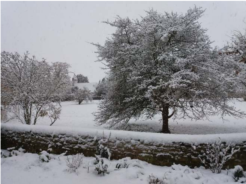
Snow in Horton-cum-Studley, December 2017

BECKLEY FOREST HILL HORTON-cum-STUDLEY STANTON St JOHN