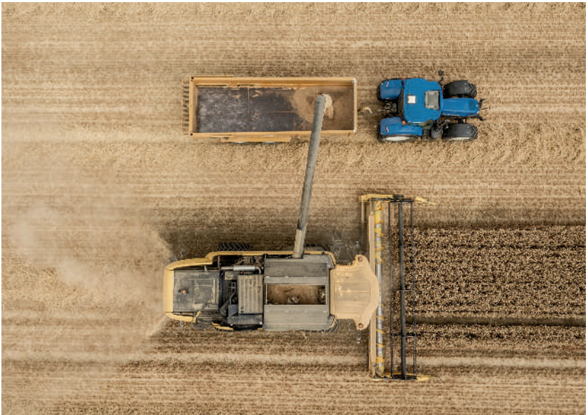
Harvest of Below Spinney, Manor Farm, Forest Hill

BECKLEY FOREST HILL HORTON-cum-STUDLEY STANTON St JOHN