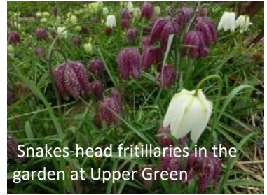
Snakes-head fritillaries in the garden at Upper Green

Home-made teas will be served at Upper Green in aid of St Barnabas Church.