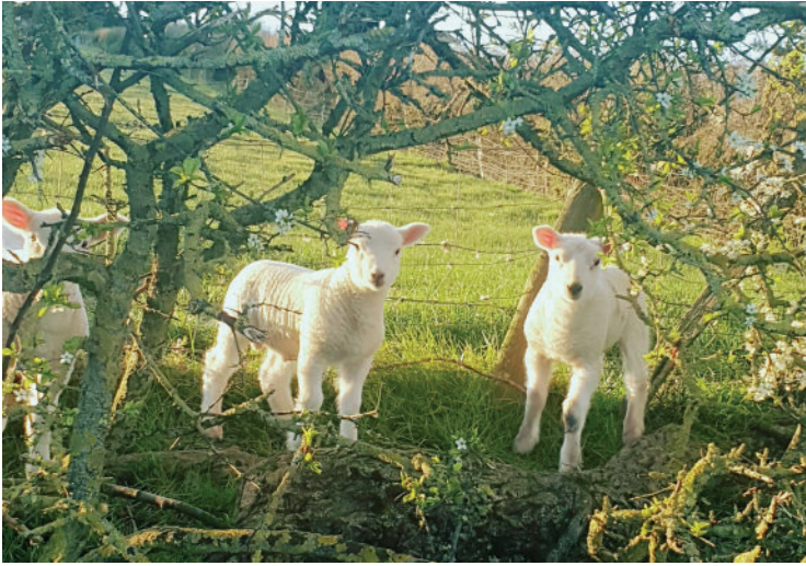
Spring lambs in the first week of spring in the Horton-cum Studley countryside