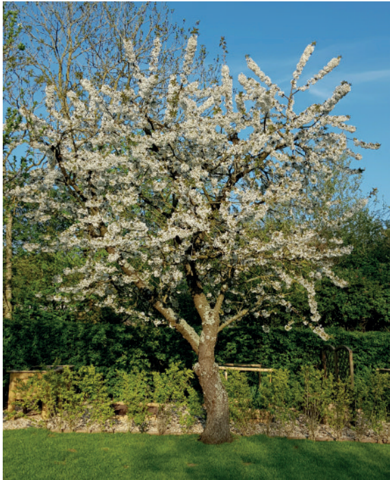
Apple blossom in Horton-cum-Studley by Julia Slingo