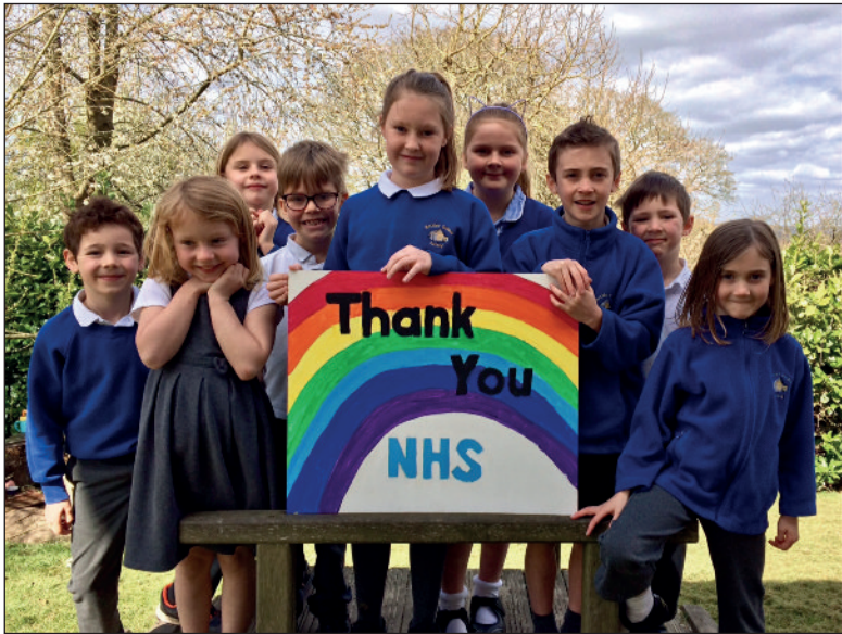
Pupils at Beckley School say 'thank you' to the NHS

BECKLEY FOREST HILL HORTON-cum-STUDLEY STANTON St JOHN