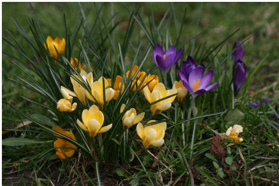
Crocuses in Bury Knowle Park, 17 February 2018

BECKLEY FOREST HILL HORTON-cum-STUDLEY STANTON St JOHN