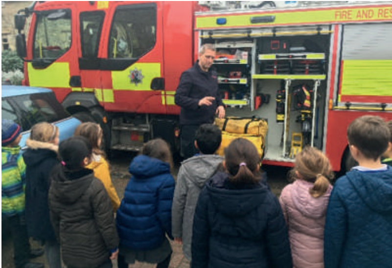
Oxfordshire Fire and Rescue Service visits Beckley School

BECKLEY FOREST HILL HORTON-cum-STUDLEY STANTON St JOHN