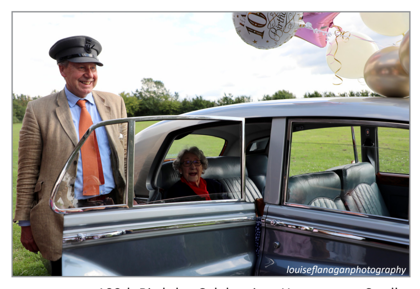
100th Birthday Celebration, Horton-cum-Studley