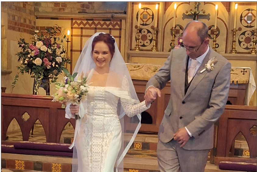
Wedding at St Barnabas, Horton-cum-Studley, October 2023

BECKLEY FOREST HILL HORTON-cum-STUDLEY STANTON St JOHN