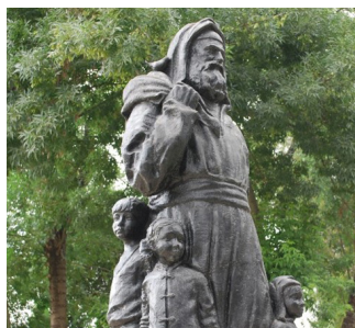
Statue of St Nicolas in Demre, Turkey

But Nicholas's story goes a lot further back in time. In life he was a Greek bishop who lived in what is now the Turkish city of Demre, near Antalya. He died in 343AD but his reputation for generosity lived on. He was particularly well known for saving three impoverished daughters of a nobleman, who might otherwise have ended up on the street, by passing them three bags of gold through a window at night. Today Christmas stockings still have three gold coins (albeit chocolate).