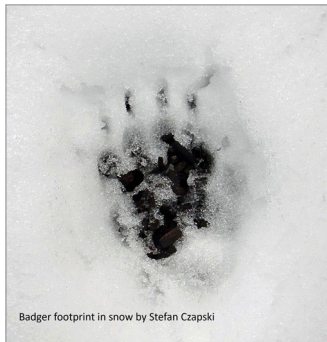
Badger footprint in snow

Many mammal species, from mice to humans, have five toes on each foot