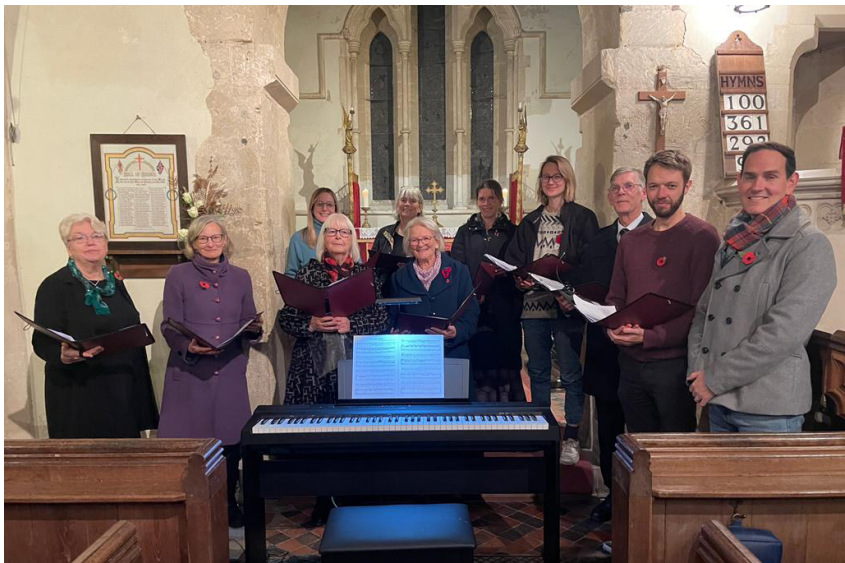
Remembrance Sunday Concert at St Nicolas, Forest Hill

BECKLEY FOREST HILL with SHOTOVER HORTON-cum-STUDLEY STANTON St JOHN