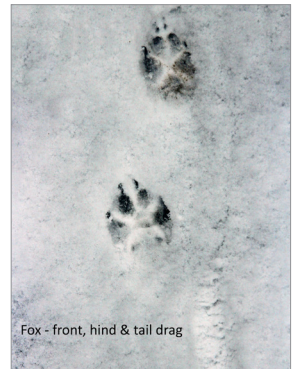
Fox - front, hind & tail drag

Dogs have four toes arranged two in front and one each side of a roughly triangular footpad, with big claw marks in front of the toes. Cat prints are generally smaller and, because cats retract their claws when walking, they have no claw marks at all. Foxes and cats often leave a straight line of pawprints, because each back foot tends to overlap with where the front foot was on the previous step. As wild cousins of dogs, foxes’ prints also have four toes, with visible claws but their footprint is